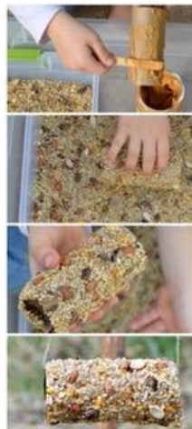
Make your own Bird Feeder